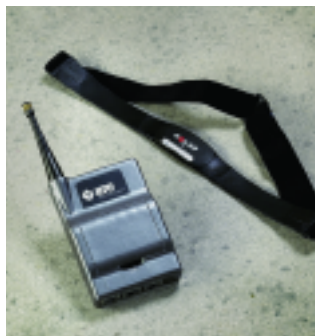
Heart rate monitoring