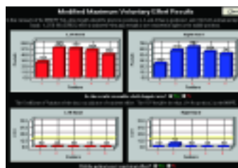
Graphic data displays